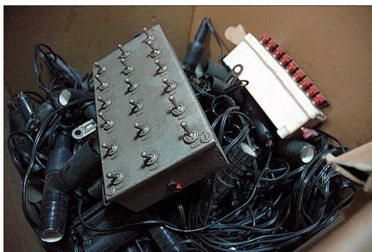
Fig. 2- Carlos Andrade, "Para onde vai a luz quando se apaga", 1972, variable dimensions (dismantled work on the image)