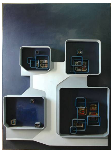
Fig. 1- José Alves, "Jogo", 1973, 186 x 132 cm.